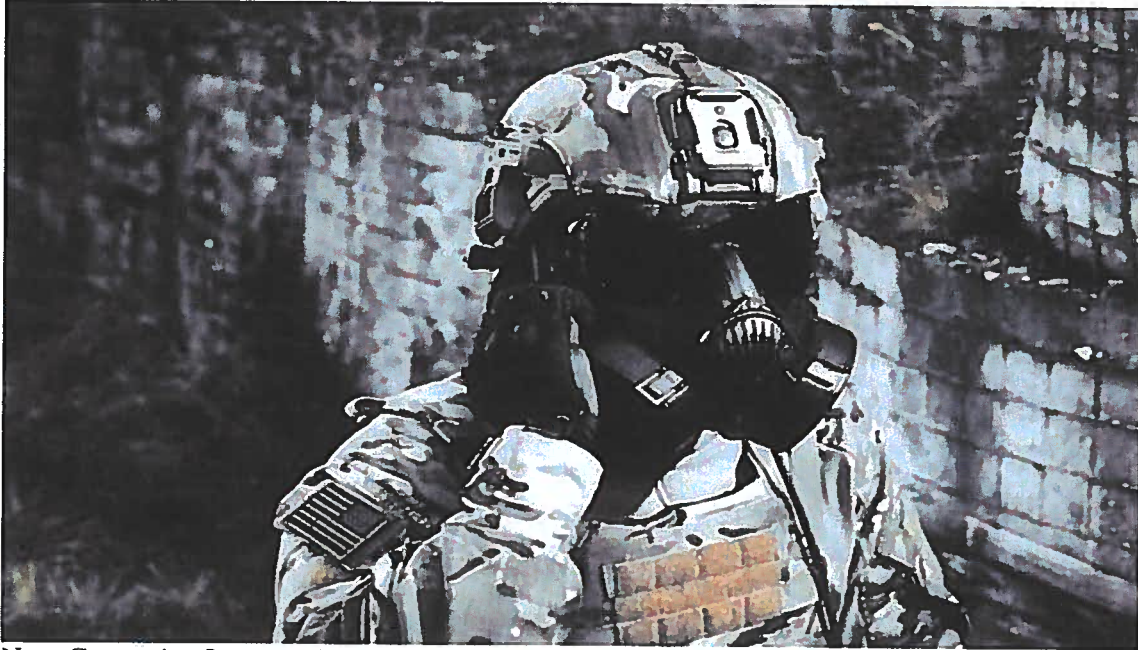
Next-Generation Integrated Head Protection System.