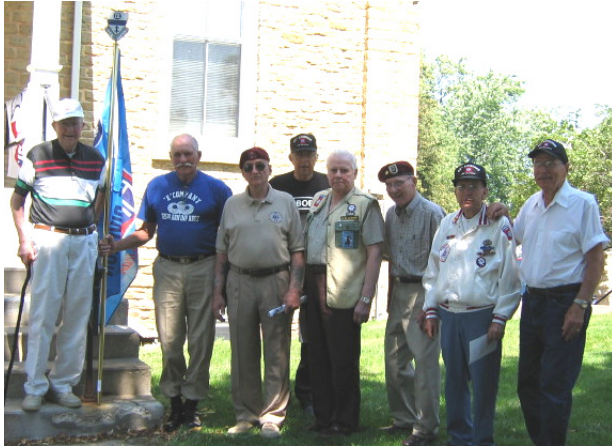
Airborne invades Ripon College!

Check your dues! Keep Badger Airborne News Dropping/Gliding in! RE-UP BSC today!