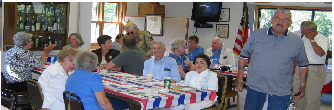
We all had a great time!