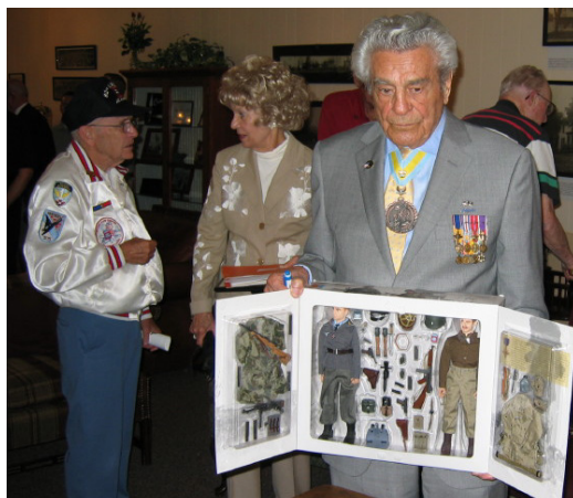
The Maggie Action Figure below is loaned to the Case.