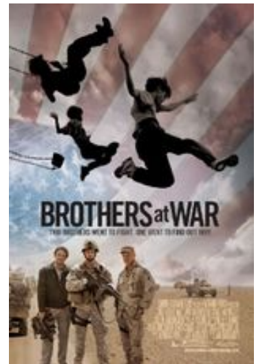
Great Airborne movie!