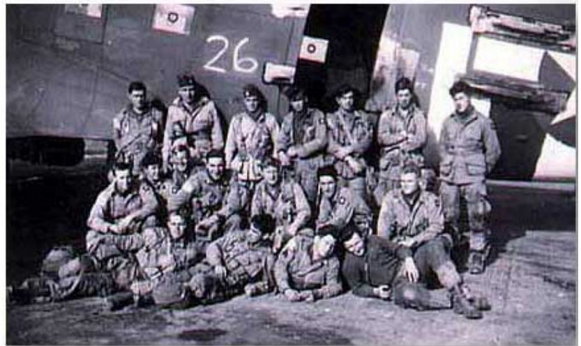
A few of Our 82nd 504 boys hours before invading Holland.

Paratroopers and Glider Riders led the way in The Pacific, Africa, Sicily, Italy,