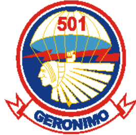
Geronimo's family permitted 501st PIR patch in 1941.