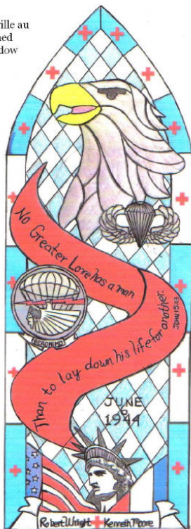
The Angoville au Plain Stained Glass Window Project.